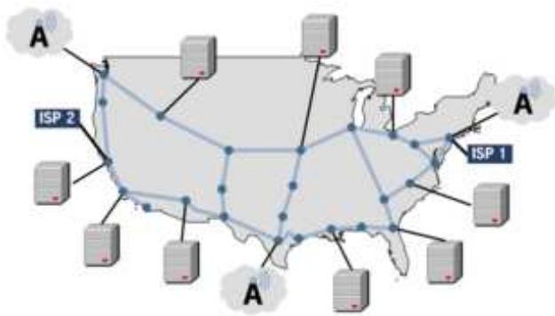
Figure 2: Planned GENI topology

clusters, and wireless subnetworks. These can then be partitioned by the management framework in such a way that each network experiment is an overlay that has exclusive rights to some subset of the components. The design of GENI is made possible by four key ideas: programmable components, virtualization of the components, seamless opt-in of the users, and modularity of the components. The envisioned topology is shown in Figure 2. A discussion of the GENI design principles is given by Peterson et al. [9]. While funding for the main GENI facility is expected to start in 2009/2010, funding from the regular NSF budget is being used to support research and prototyping efforts to reduce the technical risk in the construction of GENI.